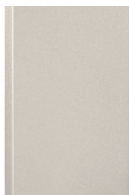
SS4: Brushed Stainless Steel