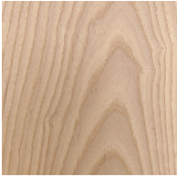
WA-N: White Ash, Natural