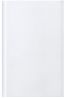
MOW: Matte Opaque White