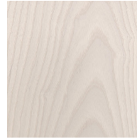
WA-WW: White Ash, Whitewashed