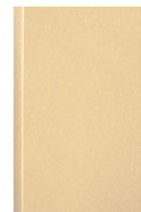
NRB: Natural Rubbed Bronze