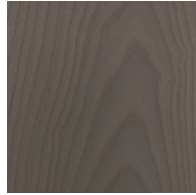
WA-G: White Ash, Grey