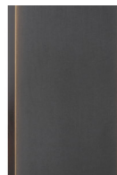
DRB: Dark Rubbed Bronze