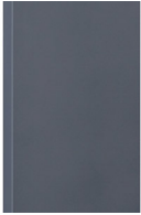
MOC: Matte Opaque Charcoal