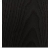
WA-E: White Ash, Ebonized