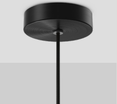
STANDARD SINGLE PENDANT CANOPY CAN.ST.120.SP.X-XXX

ALL ROSS GARDAM CEILING MOUNTED FIXTURES COME SUPPLIED WITH A CEILING CANOPY UNLESS OTHERWISE SPECIFIED. EACH CANOPY INCLUDES ELECTRICAL CONNECTORS, EARTH WIRE AND CABLE RETENTION TO CONNECT TO MAINS POWER. THE BELOW IMAGES DEPICT THE CEILING CANOPIES AVAILABLE WITH EACH FIXTURE TYPE. IF NO CANOPY IS SELECTED, THE STANDARD CANOPY (NON US/CAN REGION) OR LARGE CANOPY (US/CAN) WILL BE SUPPLIED.