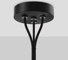
STANDARD CLUSTER PENDANT - 3 CAN.ST.120.CP3.X-XXX