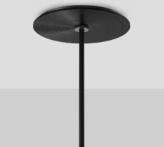
SLIM SINGLE PENDANT CANOPY CAN.SL.SP.X-XXX