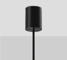
PUCK SINGLE PENDANT CANOPY CAN.PK.SP.X-XXX