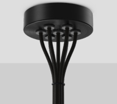
STANDARD CLUSTER PENDANT - 7 CAN.ST.CP7.X-XXX