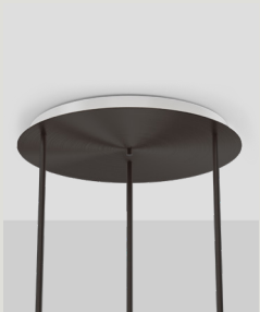
CIRCULAR FIXED CANOPY CAN.VC.CIR.X-XXX Ø480 X 37MM / 18.9" X 1.5" DRIVER HOUSED IN CANOPY

ALL ROSS GARDAM CEILING MOUNTED FIXTURES COME SUPPLIED WITH A CEILING CANOPY UNLESS OTHERWISE SPECIFIED. EACH CANOPY INCLUDES ELECTRICAL CONNECTORS, EARTH WIRE AND CABLE RETENTION TO CONNECT TO MAINS POWER. THE BELOW IMAGES DEPICT THE CEILING CANOPIES AVAILABLE WITH EACH FIXTURE TYPE. IF NO CANOPY IS SELECTED THE CIRCULAR CANOPY WILL BE SUPPLIED.