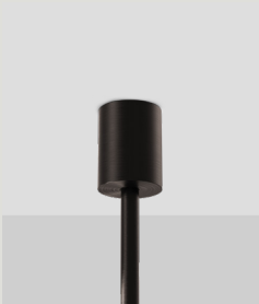
PUCK Ø14MM FIXED CANOPY CAN.PK.F14.X-XXX Ø50 X 65MM / 2" X 2.6" DRIVER HOUSED IN CEILING