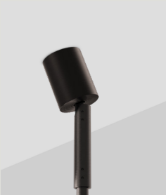
PUCK Ø14MM FIXED SWIVEL CANOPY CAN.PK.F14.SW.X-XXX Ø50 X 65MM / 2" X 2.6" DRIVER HOUSED IN CEILING