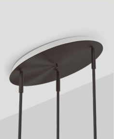
CIRCULAR FIXED SWIVEL CANOPY CAN.VC.CIR.SW.X-XXX VARIES PER ORDER DRIVER HOUSED IN CANOPY