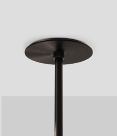
SLIM Ø14MM FIXED CANOPY CAN.SL.F14.X-XXX Ø120 X 7MM / 4.7" X 0.3" DRIVER HOUSED IN CEILING