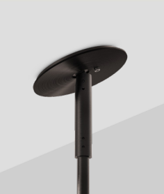
SLIM Ø14MM FIXED SWIVEL CANOPY CAN.SL.F14.SW.X-XXX Ø120 X 7MM / 4.7" X 0.3" DRIVER HOUSED IN CEILING