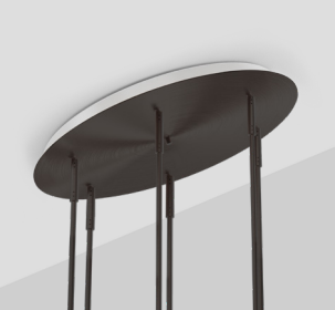
CIRCULAR FIXED SWIVEL CANOPY CAN.VC.CIR.SW.X-XXX Ø600 X 37MM / 23.6" X 1.5" DRIVER HOUSED IN CANOPY