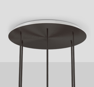
CIRCULAR FIXED CANOPY CAN.VC.CIR.X-XXX Ø600 X 37MM / 23.6" X 1.5" DRIVER HOUSED IN CANOPY

ALL ROSS GARDAM CEILING MOUNTED FIXTURES COME SUPPLIED WITH A CEILING CANOPY UNLESS OTHERWISE SPECIFIED. EACH CANOPY INCLUDES ELECTRICAL CONNECTORS, EARTH WIRE AND CABLE RETENTION TO CONNECT TO MAINS POWER. THE BELOW IMAGES DEPICT THE CEILING CANOPIES AVAILABLE WITH EACH FIXTURE TYPE. IF NO CANOPY IS SELECTED THE CIRCULAR CANOPY WILL BE SUPPLIED.